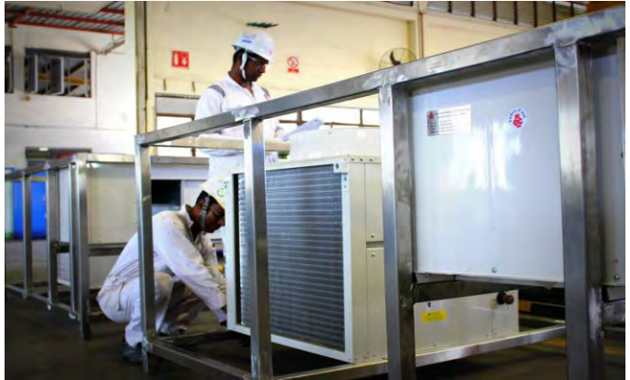
Checking of refrigeration system