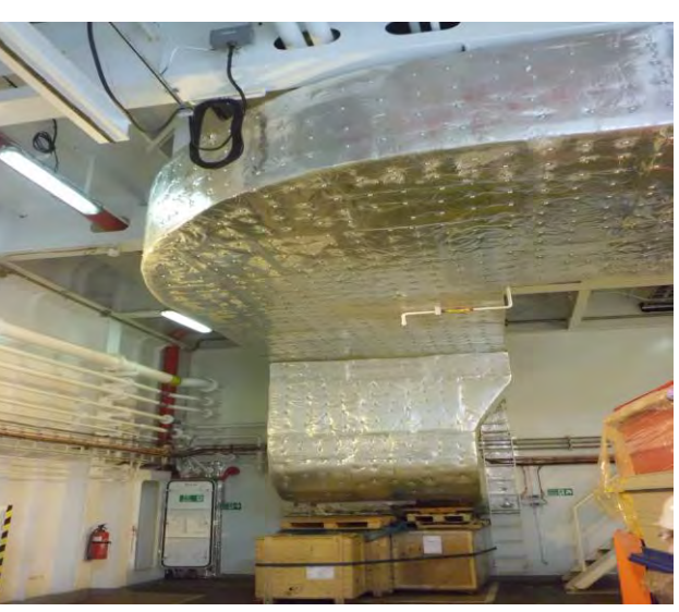
A60 Insulation on board