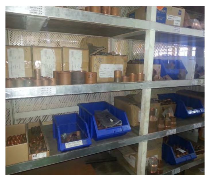
Stockist of Copper Fittings