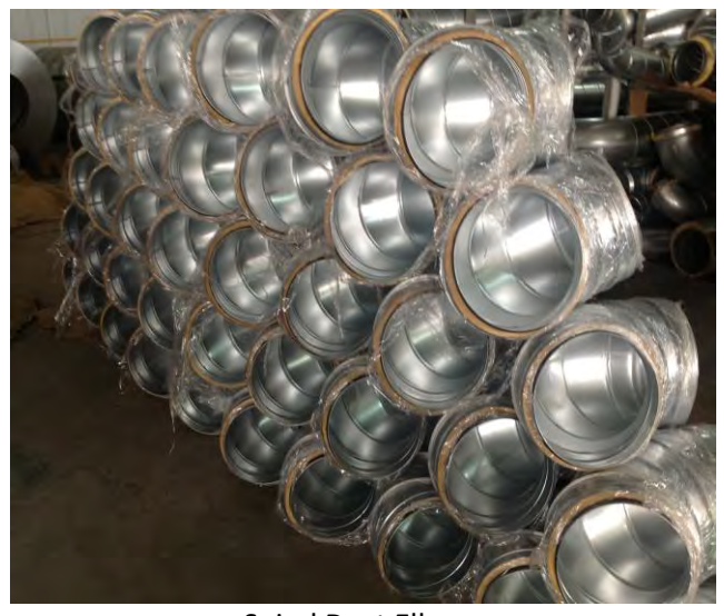
Spiral Duct Elbow