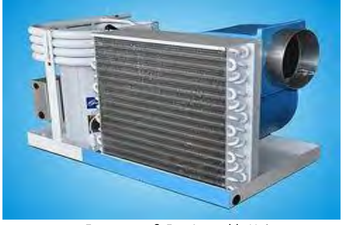
Evaporator & Fan Assembly Unit