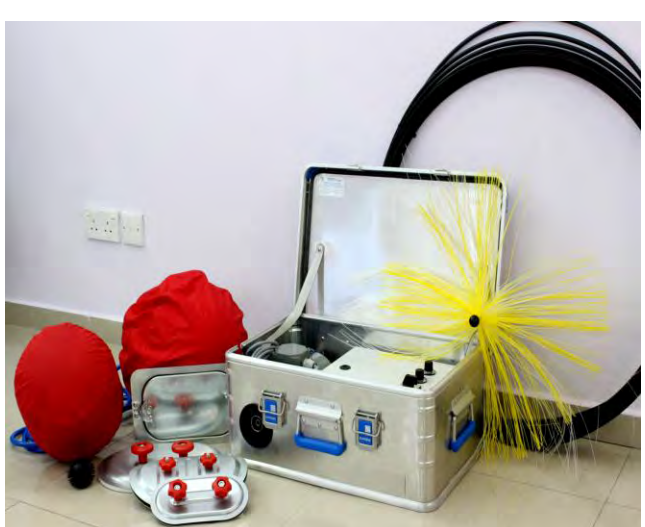
Robotic machine spare parts