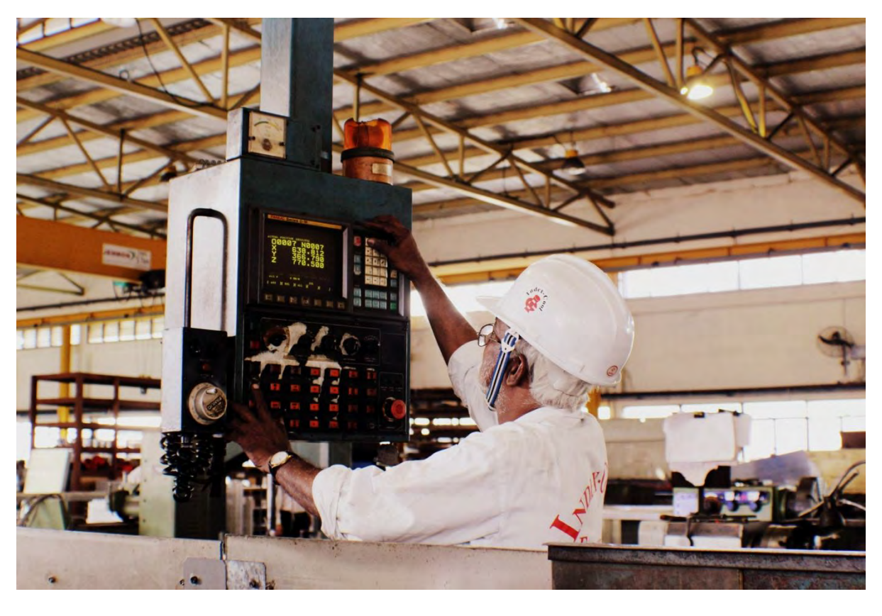
Programing of CNC Slotting Machine