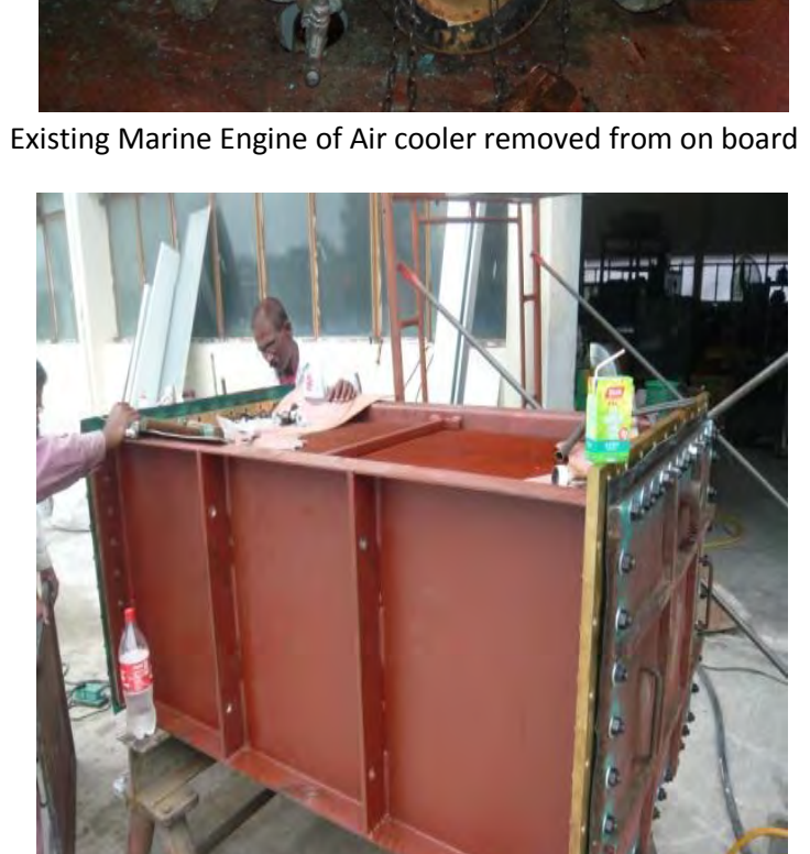
New Marine Engine of Aircooler fabrication