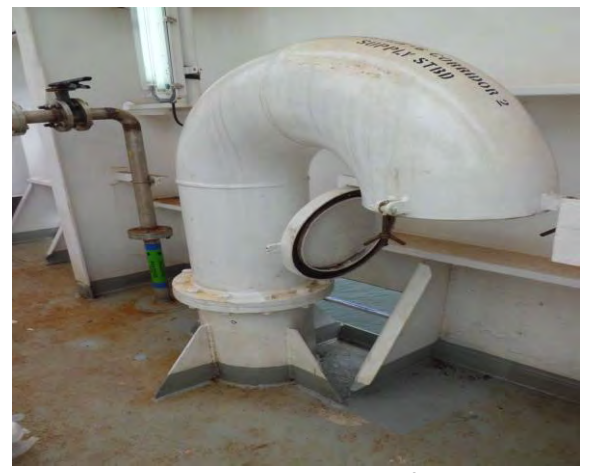
Fabrication & Installation of Gooseneck