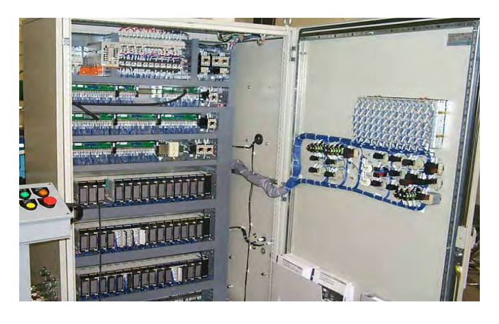
New Control Panel after Installation