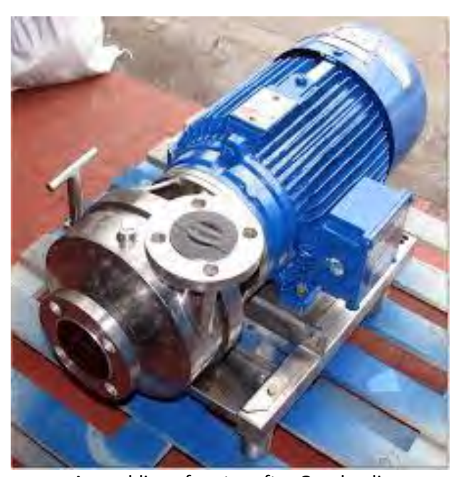
Assembling of motor after Overhauling