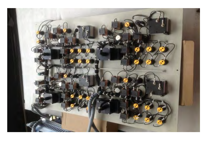
Electrical Control Switch(main board)