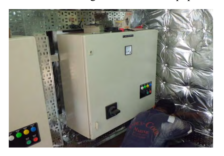
Installation of New Control Panel