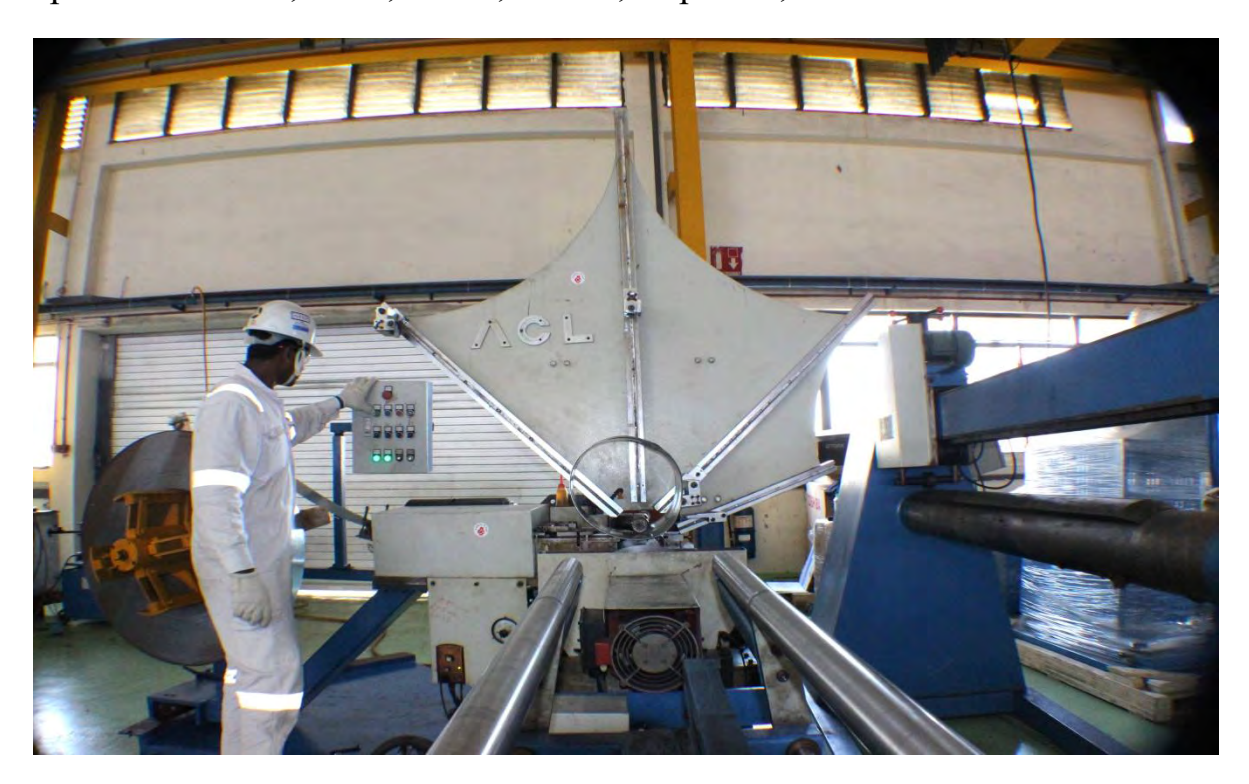
Spiral Ducting Fabrication Machine

• Range of Lathe and Milling machine are available in our facility. Stockist of various spares i.e Carrier, Bock, Bitzer, Daikin, Copeland, etc.