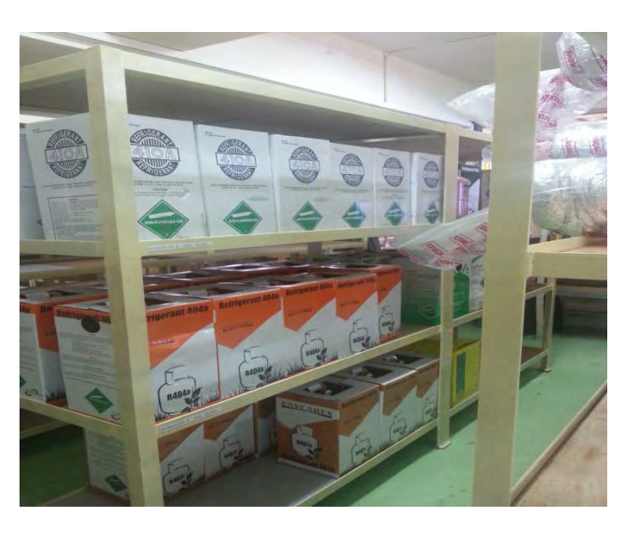
Stockist of Refrigerant Gas