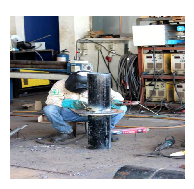
Pipe welding in Workshop