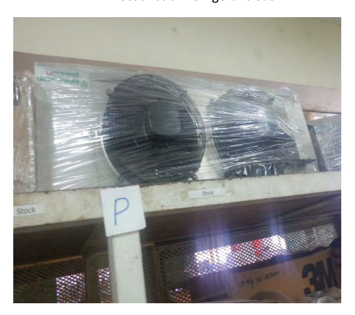
Stocist of Fan Coil unit