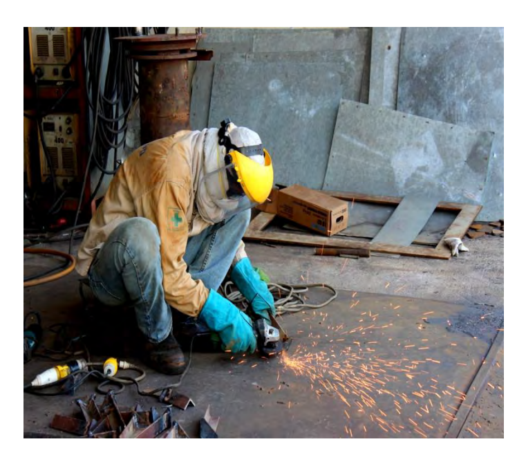
Grinding in progress