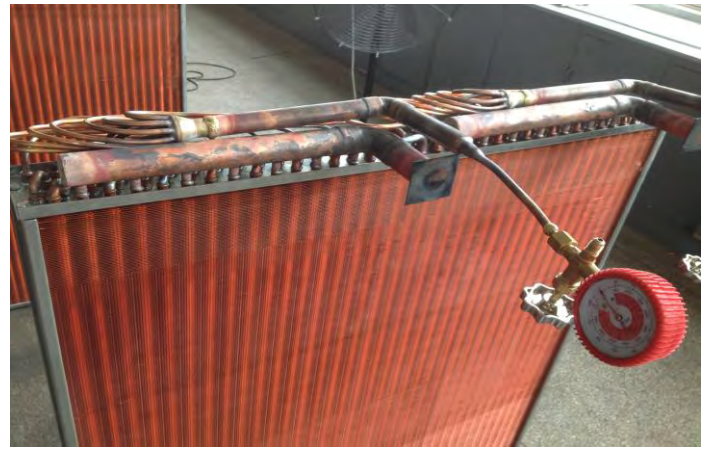
Manufacturing of Evaporator Coil with Copper Fins