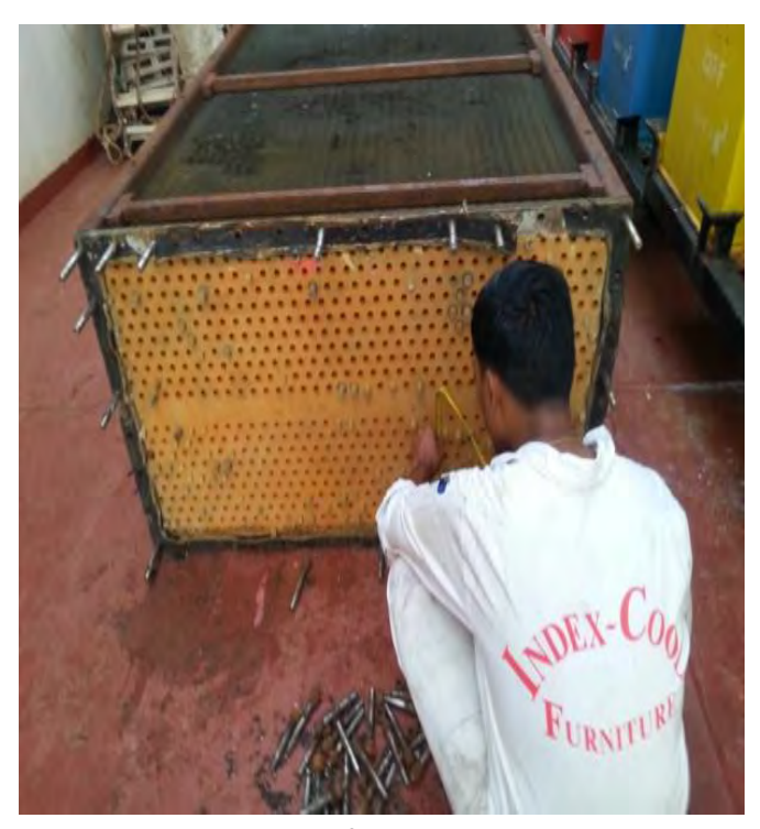
Existing Marine Engine of Air Cooler Measuring Dimension