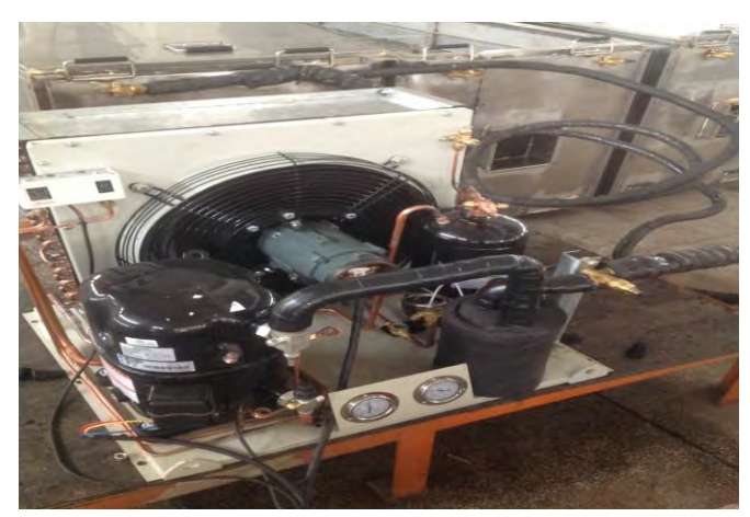
Reconditioning of Compressors