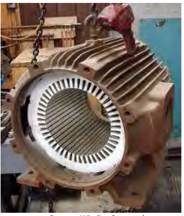
Damage Winding Removed