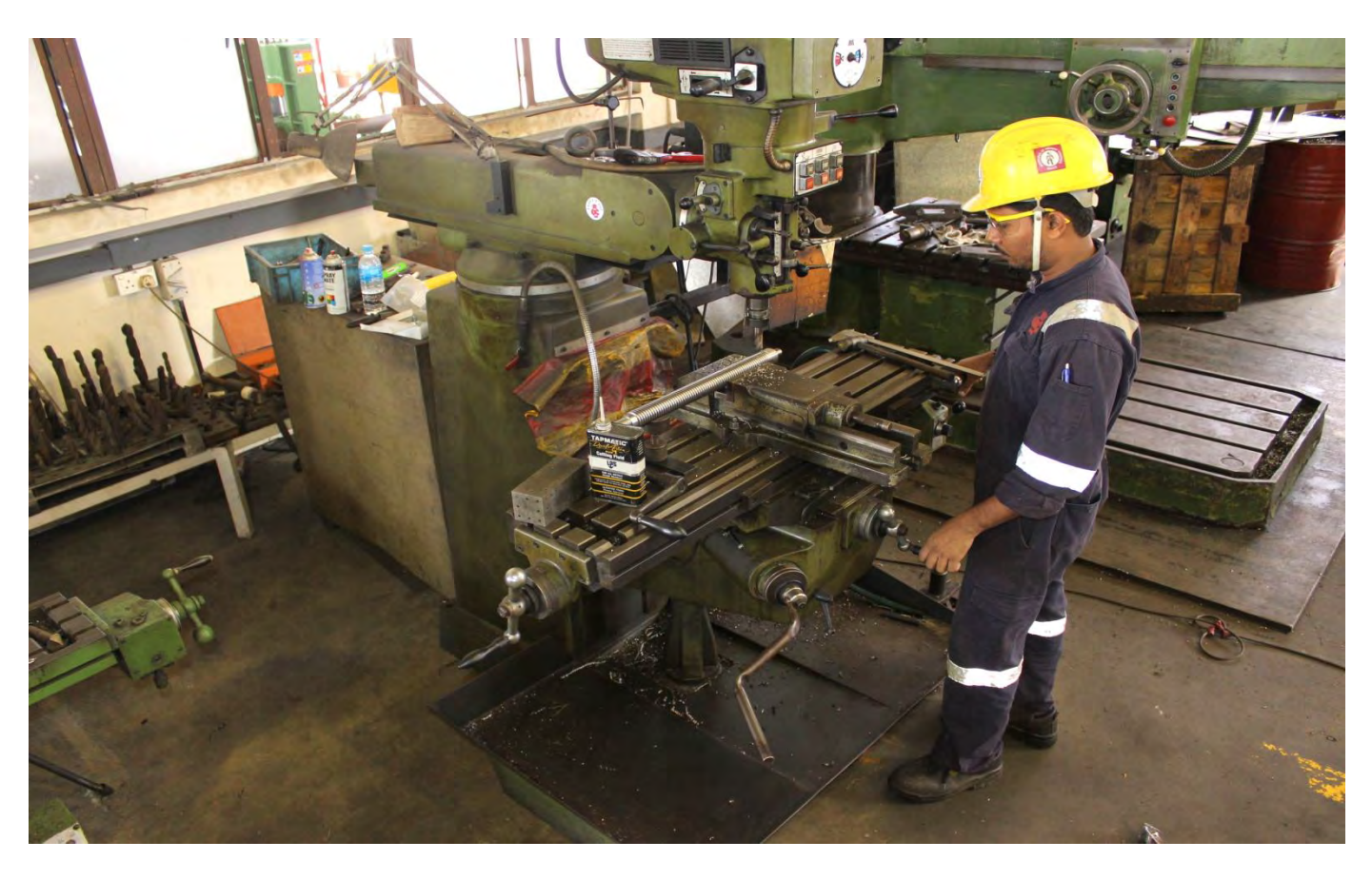
Machining of New Spindle on the Milling Machine