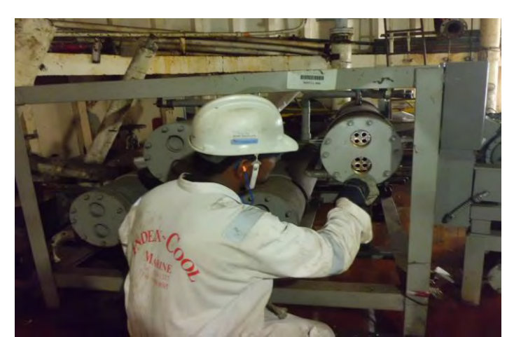
Assembling of New Condenser