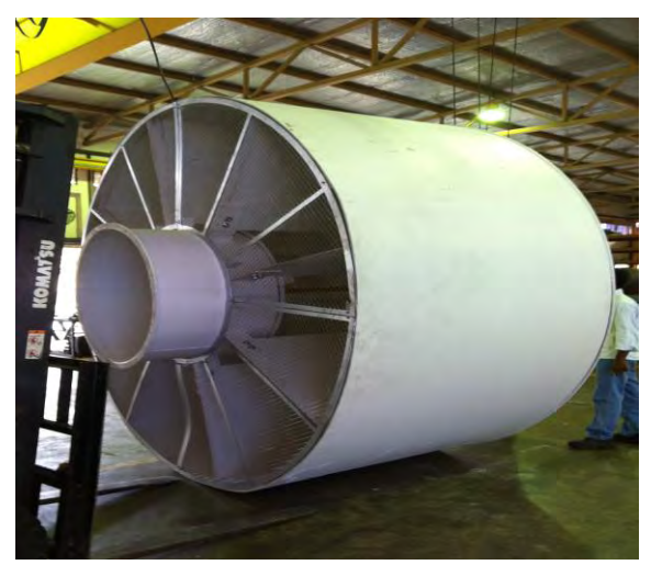
Fabrication of New Mushroom Units