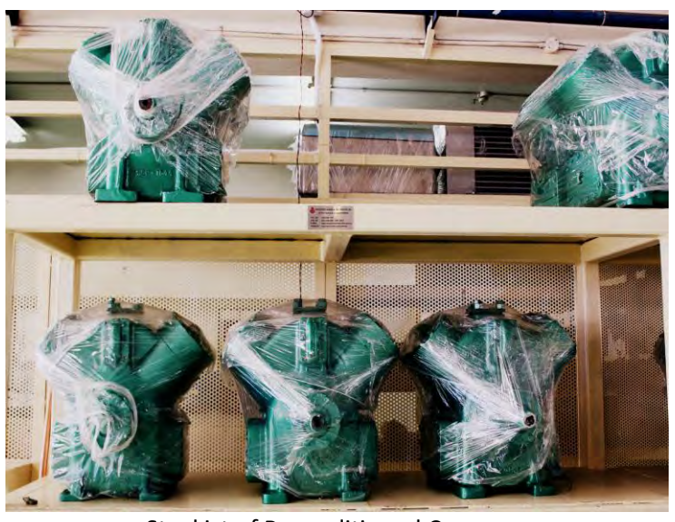
Stockist of Reconditioned Compressor