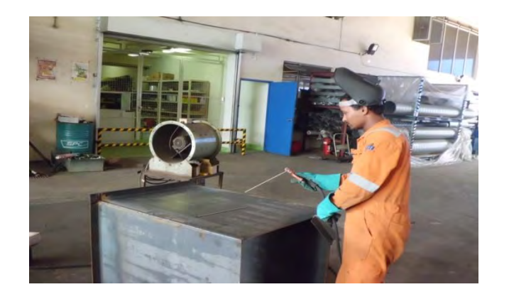
Fabrication of New Trunking in Progress