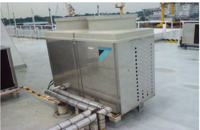
Assembling of Chiller Unit