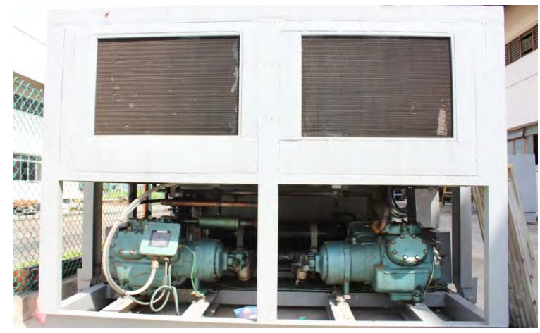
Portable AHU unit for Hire