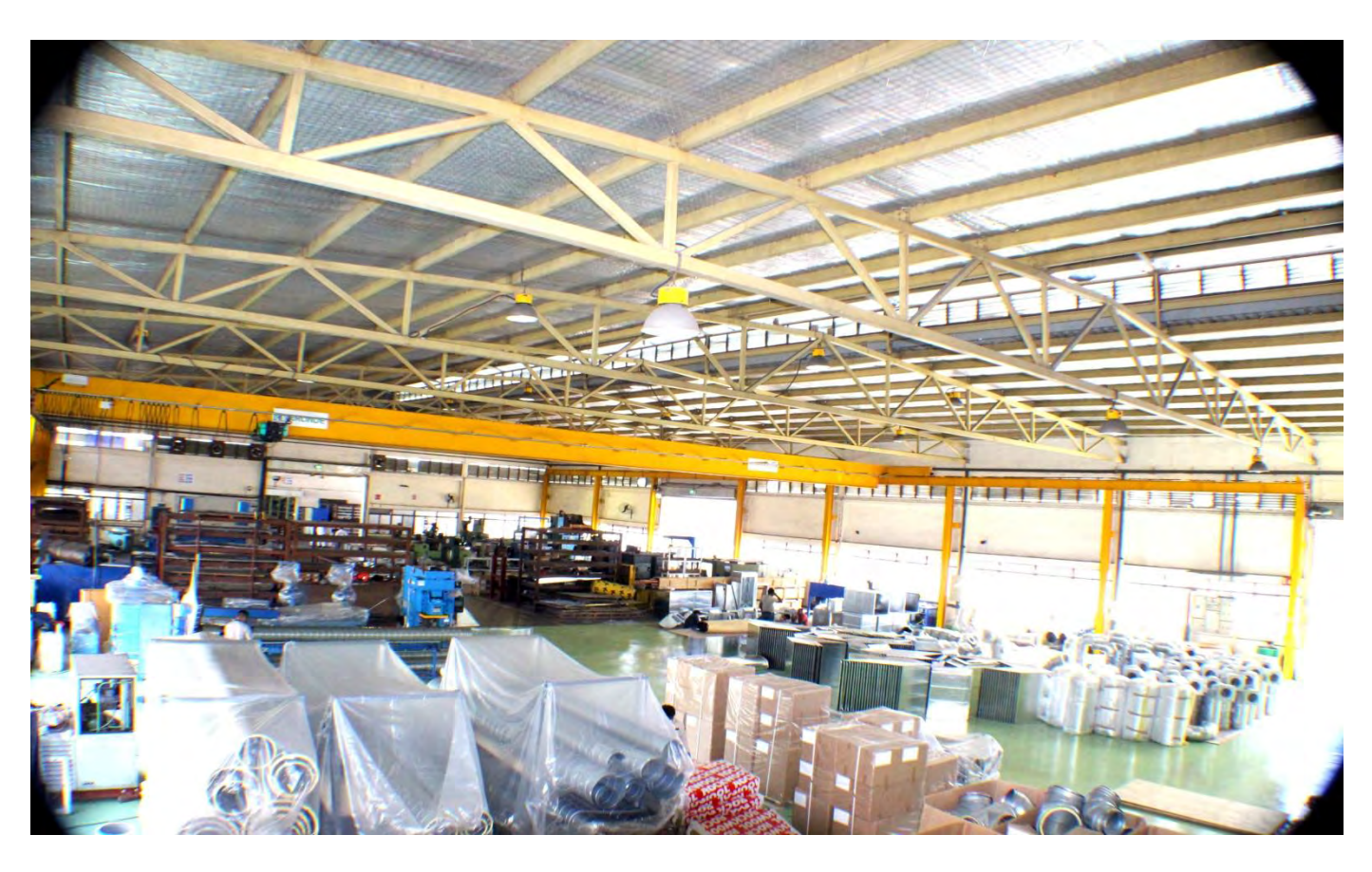
Overview of factory space