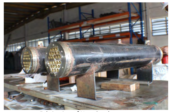
Fabrication of New Condenser

Fabrication and renewal of various types of Air Conditioning unit and related equipment, i.e Explosion / Non Explosion Proof Fans & Motors, Fire Dampers, and Exhaust Hood for Galleys.