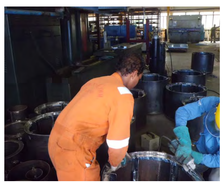
Steel work in Progress