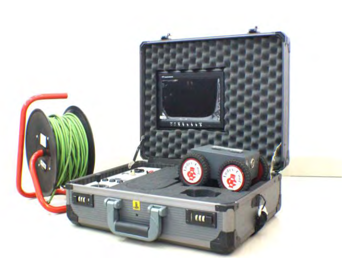
Robotic machines kits witch LCD Monitor

• An R/C Robotic drive was then place inside of the duct in order to explore the inner area of duct to determine the stage of cleanliness and other residual contaminant. Video shot shall capture all photos shoots and shall submit for references.