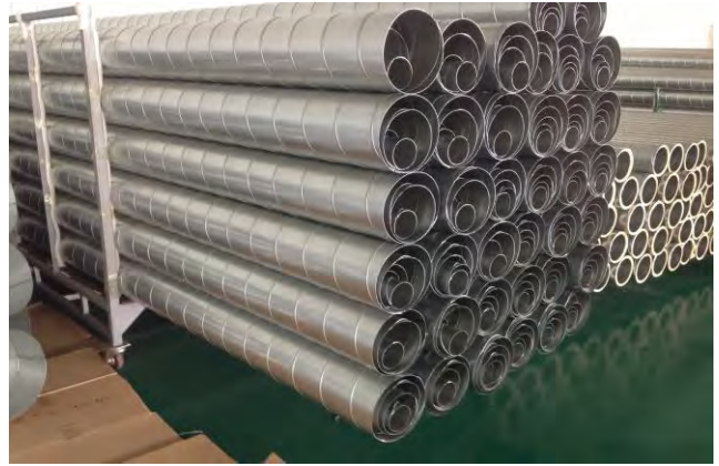
Stockiest of spiral Ducting

• Specialize in Fabricate, supply & Install of all GI/Stainless Steel Ducting, Duct fittings that give consistency and aesthetics to the Marine's appearance.