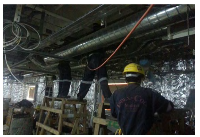
Installation of spiral ducting