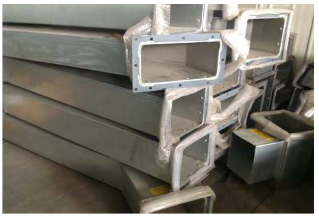
G.I Rectangular Ducting