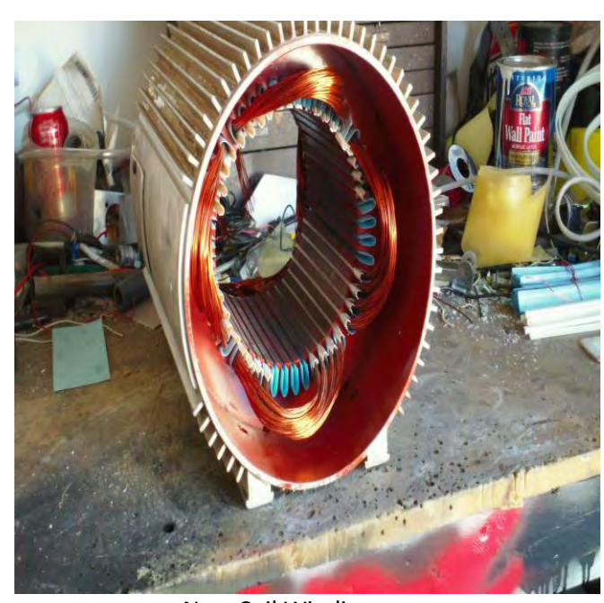
New Coil Winding