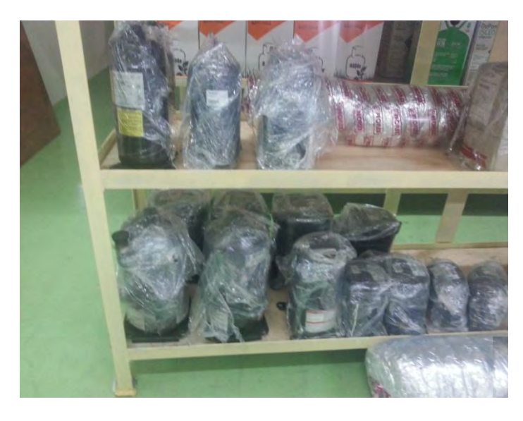
Stockist of Sealed Compressor