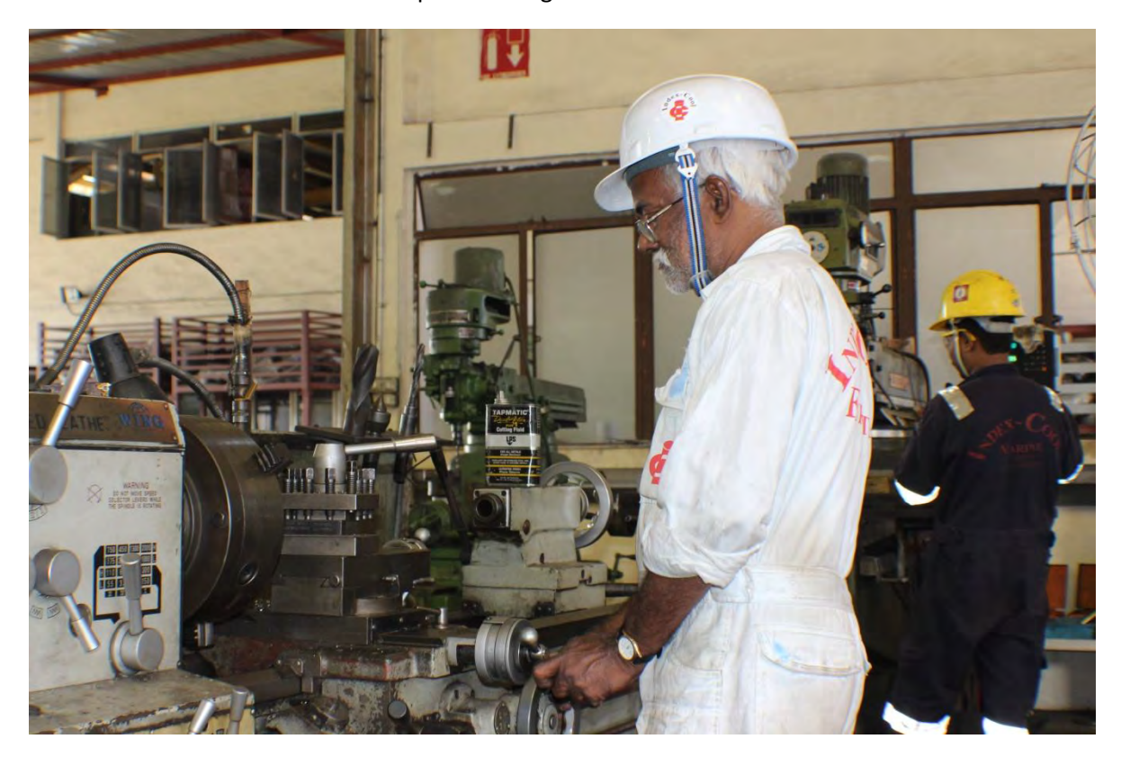
Lathe Work in Progress