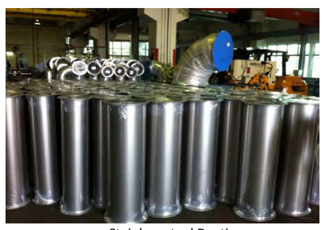
Stainless steel Ducting