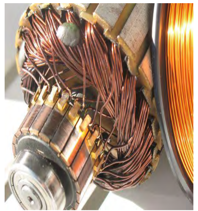
Motor damage winding