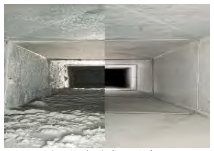
Ducting cleaning before and after