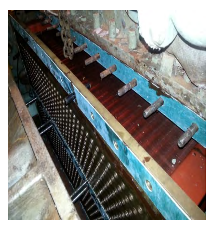
New Marine Engine of Aircooler Installation