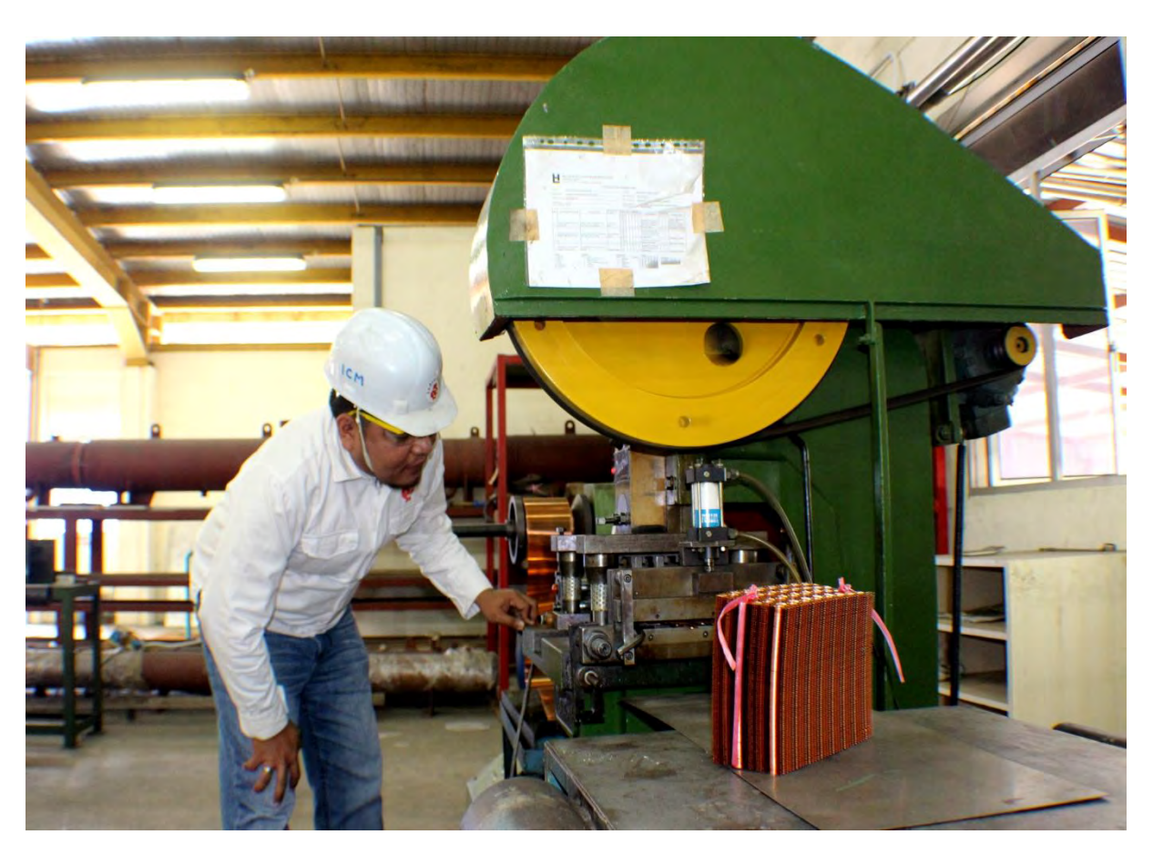
Coil fins Stamping Machine